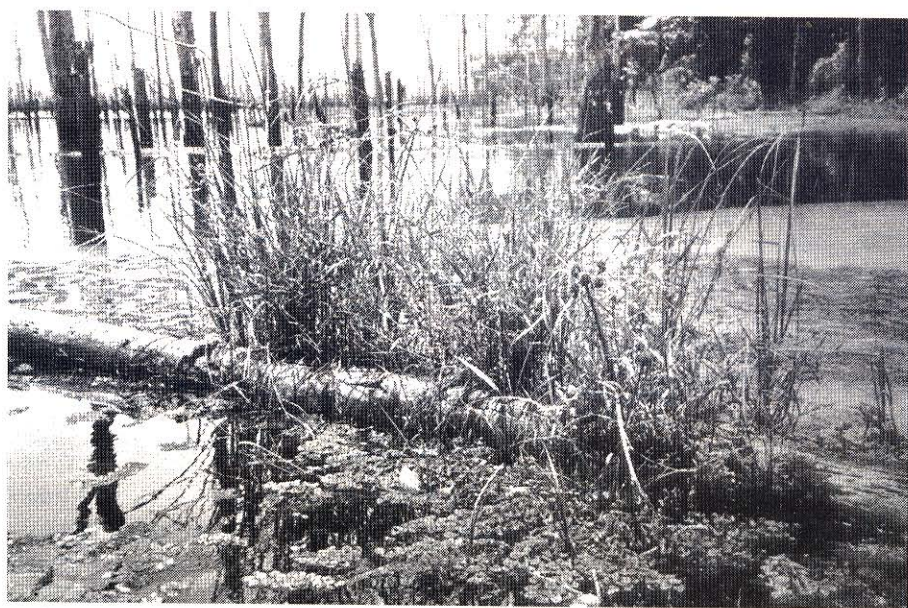
Figure 3. Floating trunk with vegetation and Salvinia in the vegetation belt of the Serra do Chocador island.