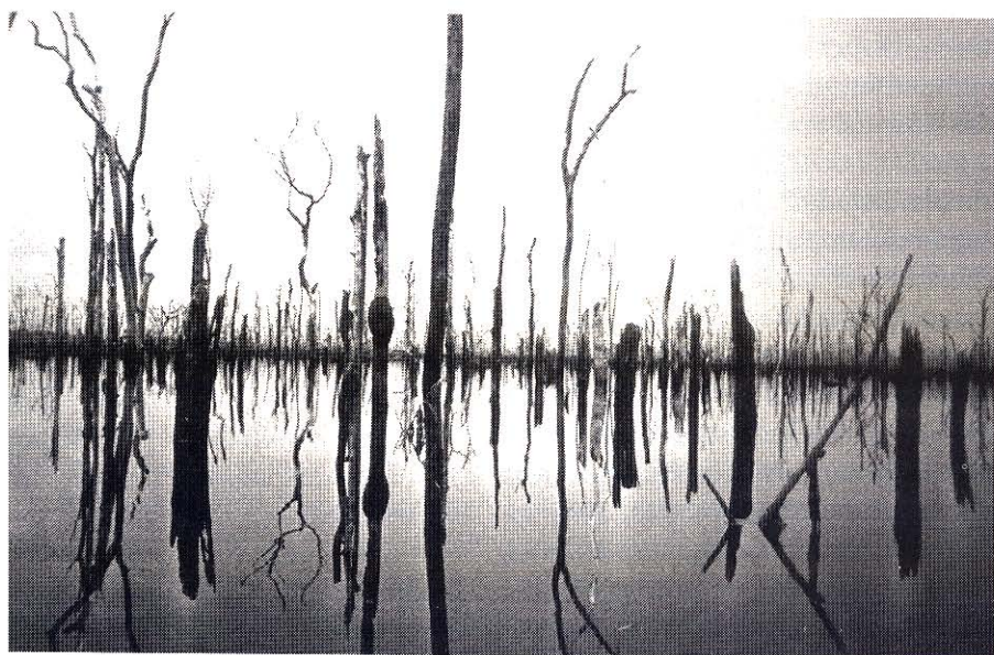
Figure 2. Dead forest during the low water period in September 1995. Nasutitermes sp. colony above the dark lower segment that marks the high water level.